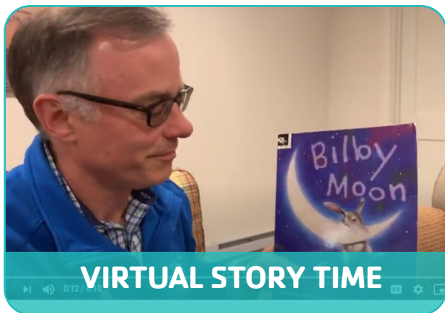
VIRTUAL STORY TIME

Throughout the pandemic the YMCA worked tirelessly to stay connected to our YMCA community through check-in calls to homebound seniors, virtual story times for our Holly Pond School families, community videos and private one-on-one outdoor training.